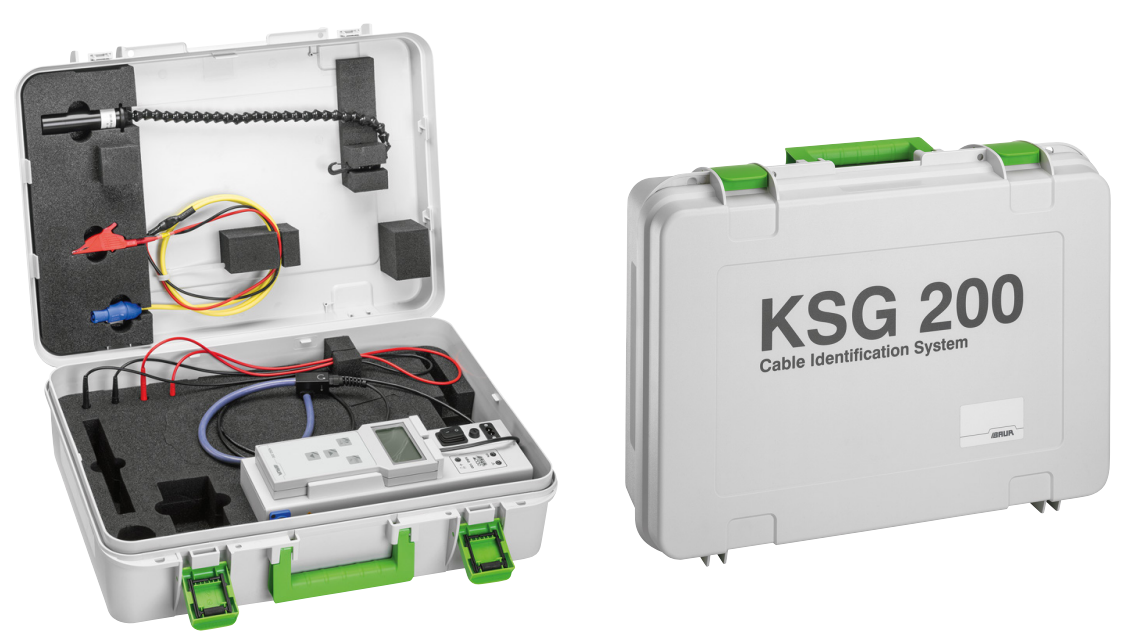
Figure: KSG 200 T (without battery)