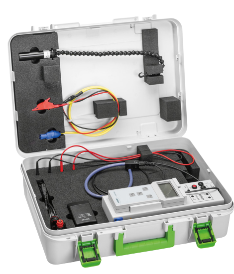
Figure: KSG 200 TA (with battery)